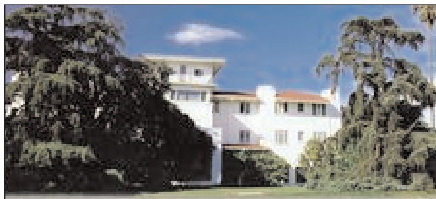
Self-Realization Fellowship International Headquarters in Los Angeles, California

Kirtan is Indian-style devotional singing to God, accompanied by traditional instruments such as the harmonium, tablas, cymbals and the tamboura. Group kirtan offers a chance to go longer and deeper in chanting. All are welcome.